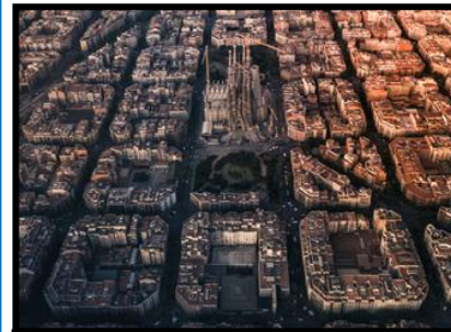
This is an aerial photo of Barcelona with the Sagrada Familia in the middle.

The world is split into the Northern Hemisphere and the Southern Hemisphere. The equator is what divides them. England and Spain are both in the Northern Hemisphere.