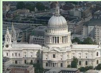
St Paul's Cathedral