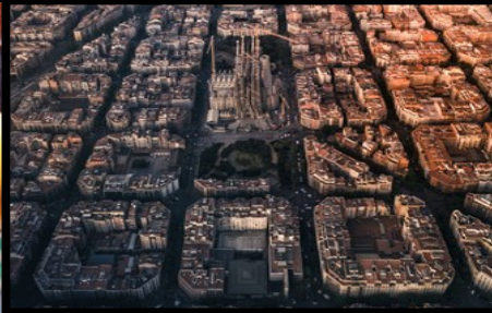
Aerial photograph of Barcelona. The Sagrada Familia , a cathedral designed by Gaudi, is centre.