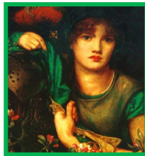
My Lady Greensleeves by Dante Gabriel Rossetti