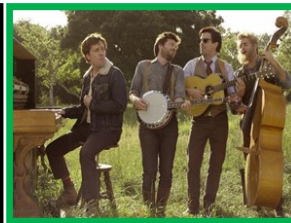
Contemporary folk group Mumford and Sons