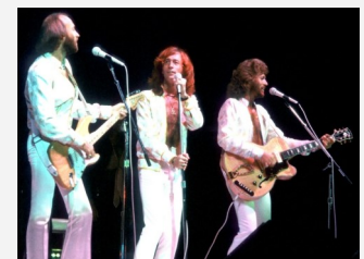
The Bee Gees